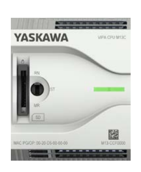
CPU M13C M13-CCF0000 PROFINET Controller